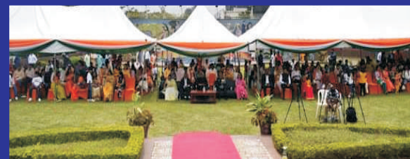
Cross-section of guests at the High Commission in Abuja