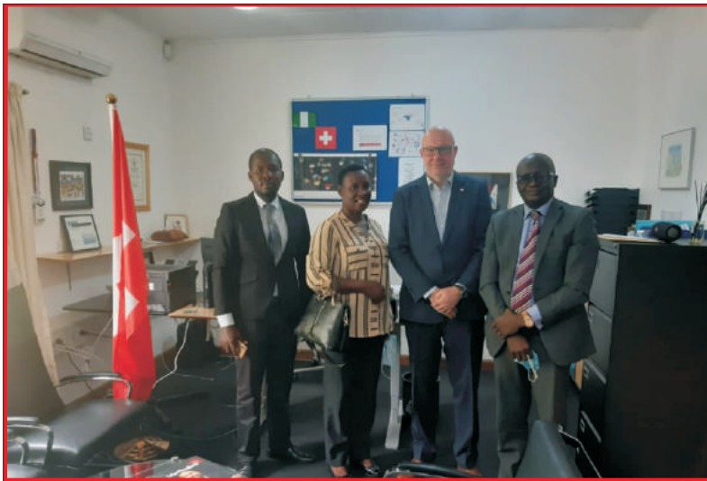
Photo session of Acclaim Nigeria International Magazine with Consul General Schneider at his office

As governments and people of Switzerland and Nigeria seek new ways to promote and consolidate on the gains of bilateral ties, Swiss mission in Nigeria is also ensuring these collaborative and development efforts produce more beneficial and enduring outcomes.