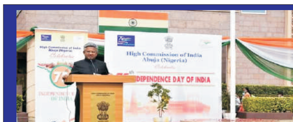
High Commissioner Abhay Thakur delivery the President Message in Abuja

The Abuja event had a scintillating 2-hour performance including patriotic songs, dances, skits and poetry followed, while the Lagos event was spiced by songs presentation from students of the Indian Language School in Lagos. Refreshments, paintings, photo-sessions, display of photo-gallery of India's historical and modern attainments, and mingling among guests comprising Citizens of India, Persons of Indian Origin and Friends of India added colour to the ceremony. As it celebrate the occasion of the Amrit Mahotsav of freedom 'Incredible India' has a lot of things to be grateful for at 75. LONG LIVE THE REPUBLIC OF INDIA