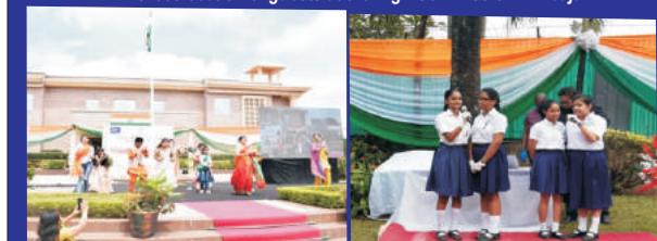
Cultural and Dance presentations by the combination of Children and Adults in Abuja during their song presentations