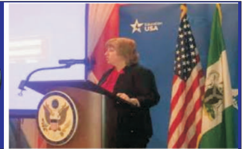
Ms FitzGibbon representing the U.S. Embassy in Nigeria on Nation Building pursuits