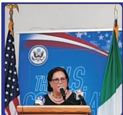
Consul General Claire Pierangelo delivering remarks during the event

United States of America is known to play strategic roles in global humanitarian and societal improvements. Through its enormous democratic, diplomacy and defense commitments, U.S. vanguards crucial development interventions seen and felt across the world. Its philosophies, politics, promotions, power, philanthropy and people are geared towards supporting a free, safe and improved world. Being a steadfast