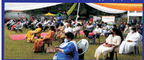
Cross-section of guests at the Office of the High Commissioner in Lagos